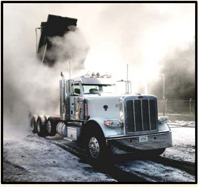
2018 Emergency Response

Marion Environmental Inc. is one of the leading providers of environmental consulting, remediation, and emergency response in the southeast. Our goal is to provide cost effective solutions to environmental problems. Making our standard, industry standard.